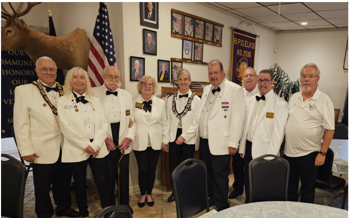
Your Officers after the recent District Deputy Visit!