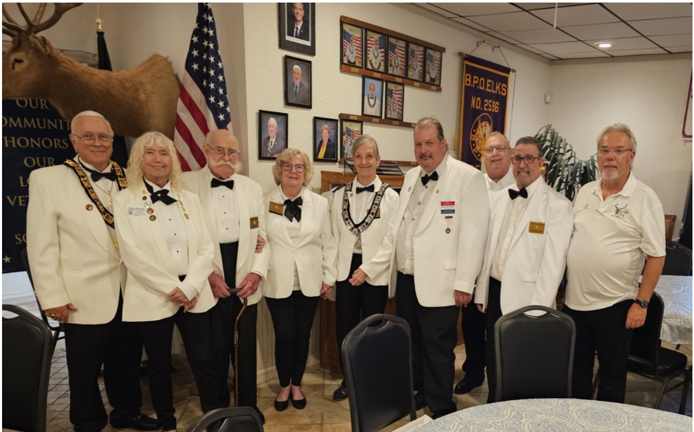
Your Officers after the recent District Deputy Visit!