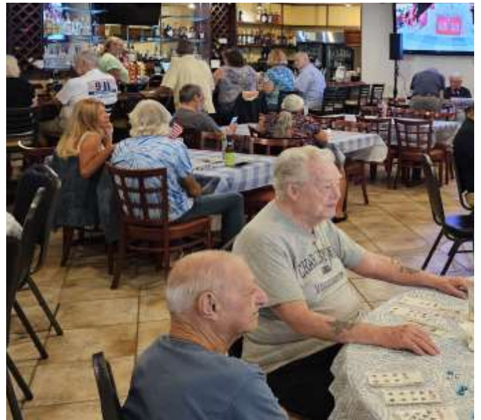
School Daze Event